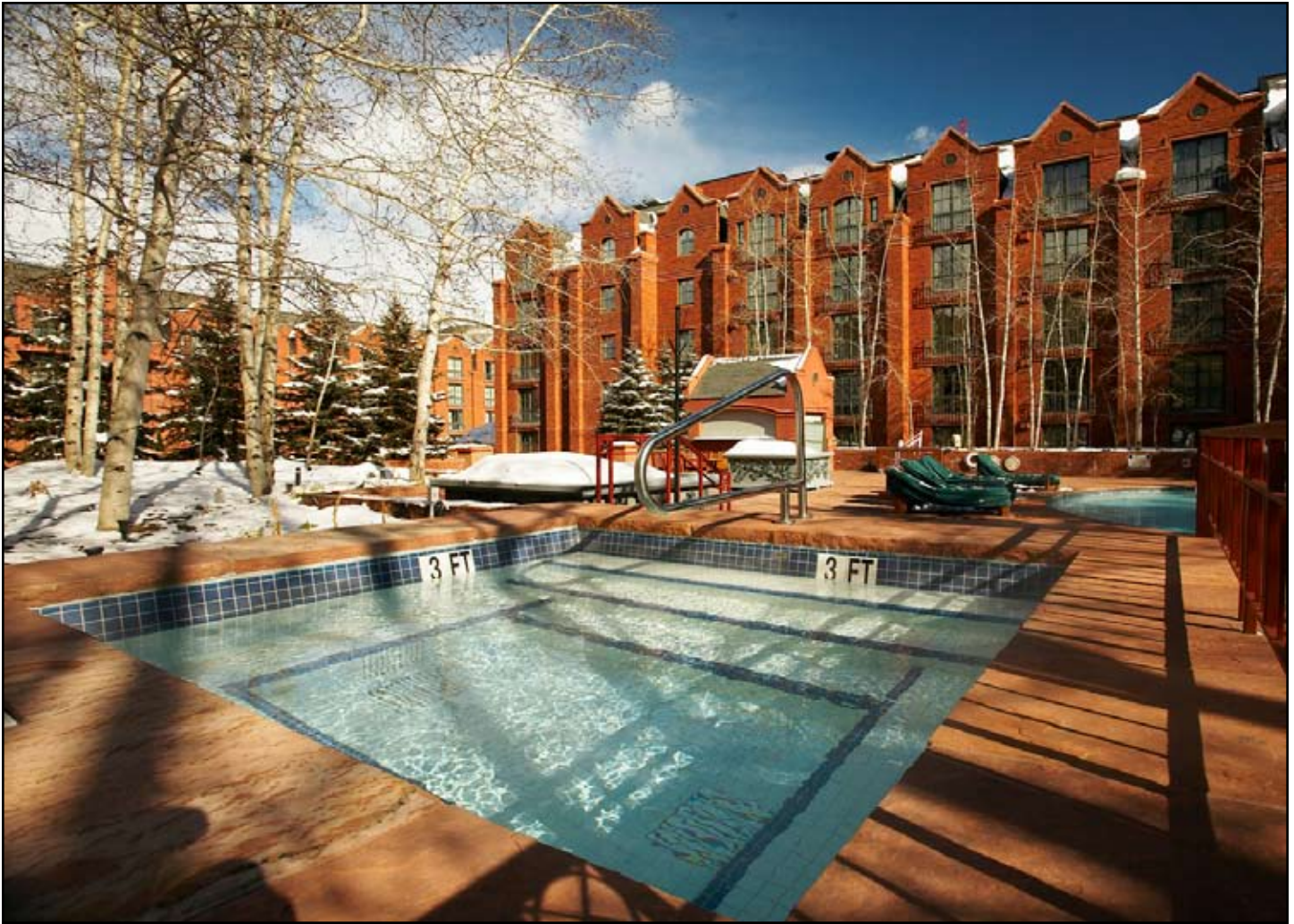
ST. REGIS POOL