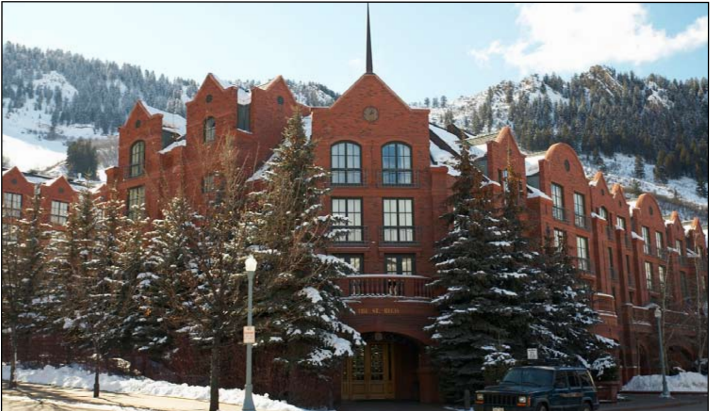
ST. REGIS EXTERIOR